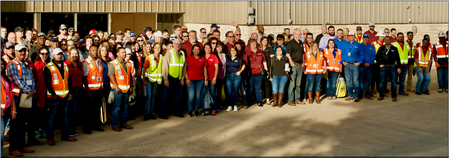
In October, CMEF held its annual Construction Careers Exposition in Pasadena.