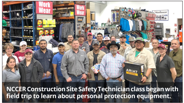
NCCER Construction Site Safety Technician class began with field trip to learn about personal protection equipment.

The Young Professional group hosted a Chili Cookoff and Cornhole Tournament on November 7, at VCS Companies. Over 100 attendees enjoyed chili cooked by 9 teams as they watched the cornhole teams battle for first place in the tournament.