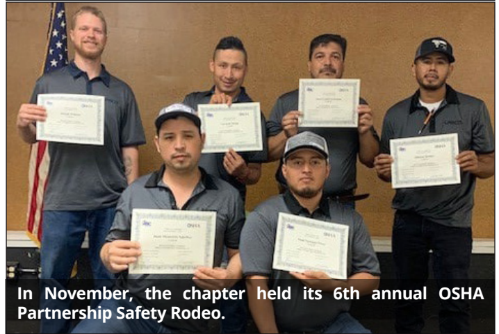
In November, the chapter held its 6th annual OSHA Partnership Safety Rodeo.

The chapter is very proud of its membership growth accomplishments in 2019. At the end of the year, ABC Central Texas will be at a net growth of slightly over 15%. This was achieved by tremendous support from the chapter's outstanding Board of Directors as well as the highly-engaged chapter Membership Committee!