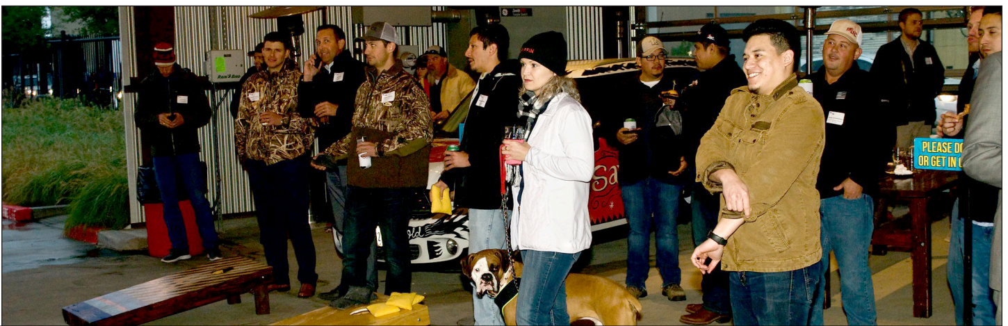
In November, the Houston chapter held its annual Cornhole Tournament. Funds from the event went toward the Scholarship Foundation, which benefits students in local community colleges and universities who are interested in pursuing a career in construction.