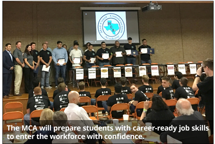
The MCA will prepare students with career-ready job skills to enter the workforce with confidence.

Quality representation. Practical advice. a full service construction law firm