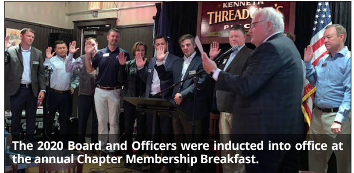
The 2020 Board and Officers were inducted into office at the annual Chapter Membership Breakfast.

The Fall Golf tournament held this past September sold out in three days – a first for this particular event. The Fishing Tournament in October was a success in spite of the first major cold front hitting the day of the event. And the Sporting Clays Shoot held in November was the largest since moving to the National Shooting Complex. There was no winner in the Member Bucks drawing at the Volunteer Appreciation Mixer so the drawing in January will be for $1,000.