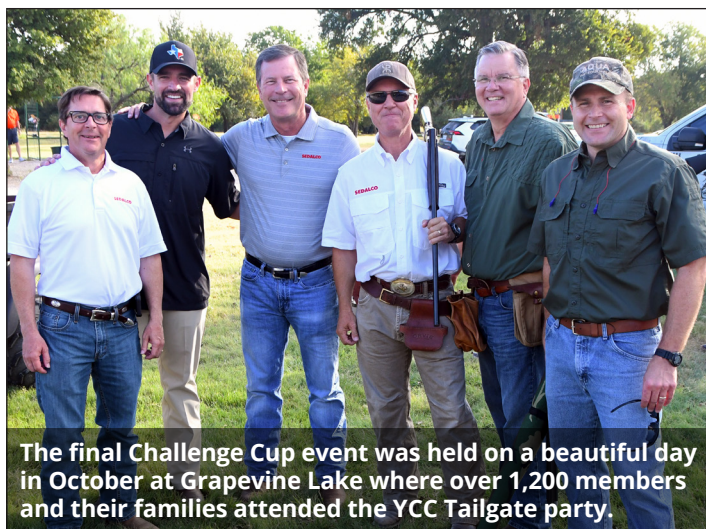
The final Challenge Cup event was held on a beautiful day in October at Grapevine Lake where over 1,200 members and their families attended the YCC Tailgate party.